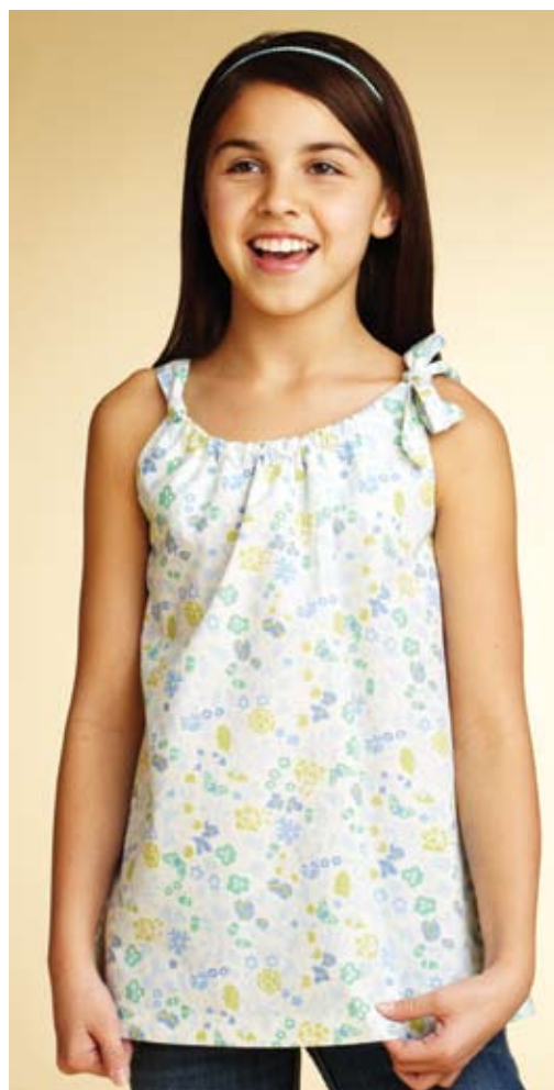
View A Back